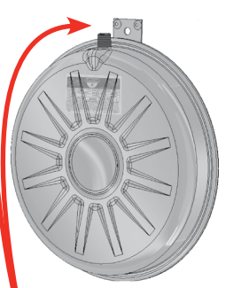
Union with double service check included with each tank.