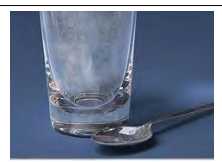
White spots on glassware and countertops