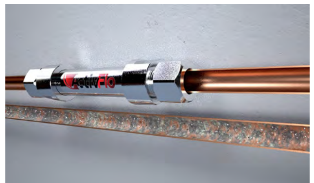
Pipe sections with and without Activflo