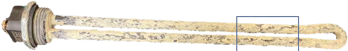
Limescale buildup on a water heater electric element caused by calcium bicarbonate

Just 1/16" of limescale will decrease the efficiency of an appliance by 12% and 1/8" a reduction of 25%