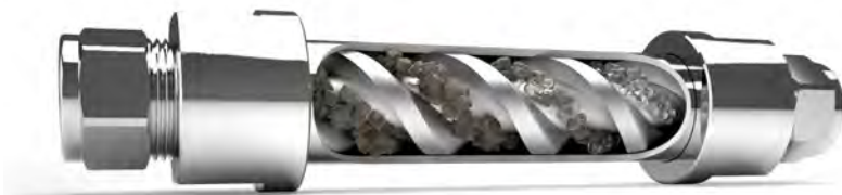
Cross Section of the Activflo showing internal catalytic coil

The aragonite cannot adhere to surfaces in the same way as limescale and is washed through the system down the drain.