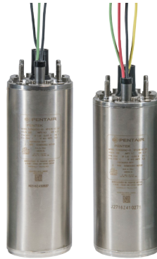
Pentair Pentek Submersible Motor (2 or 3 wire)