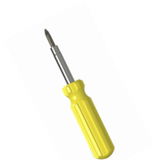
Phillips Head Screwdriver