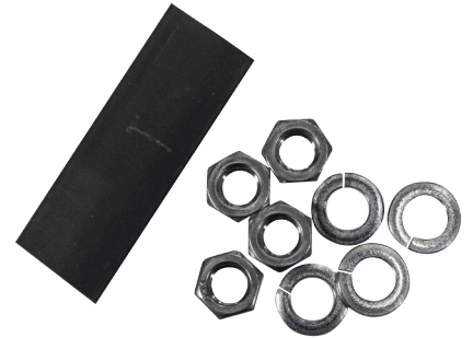
Miscellaneous Parts Bag (4) Lock Washers (4) 1/2" Nuts (1) Wire Protection Sleeve