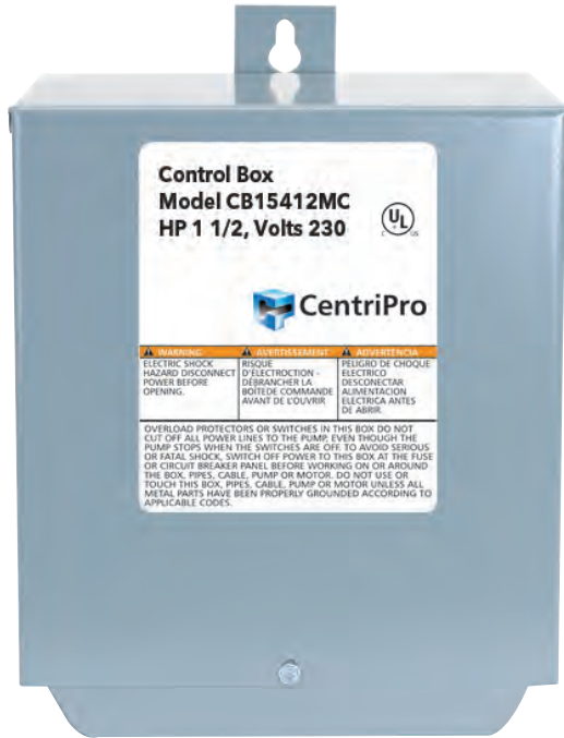
1½ - 3 HP

For 3-wire, 1½ – 5 HP Submersible Motors