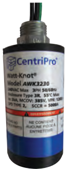
AWK3230 / AWK3460